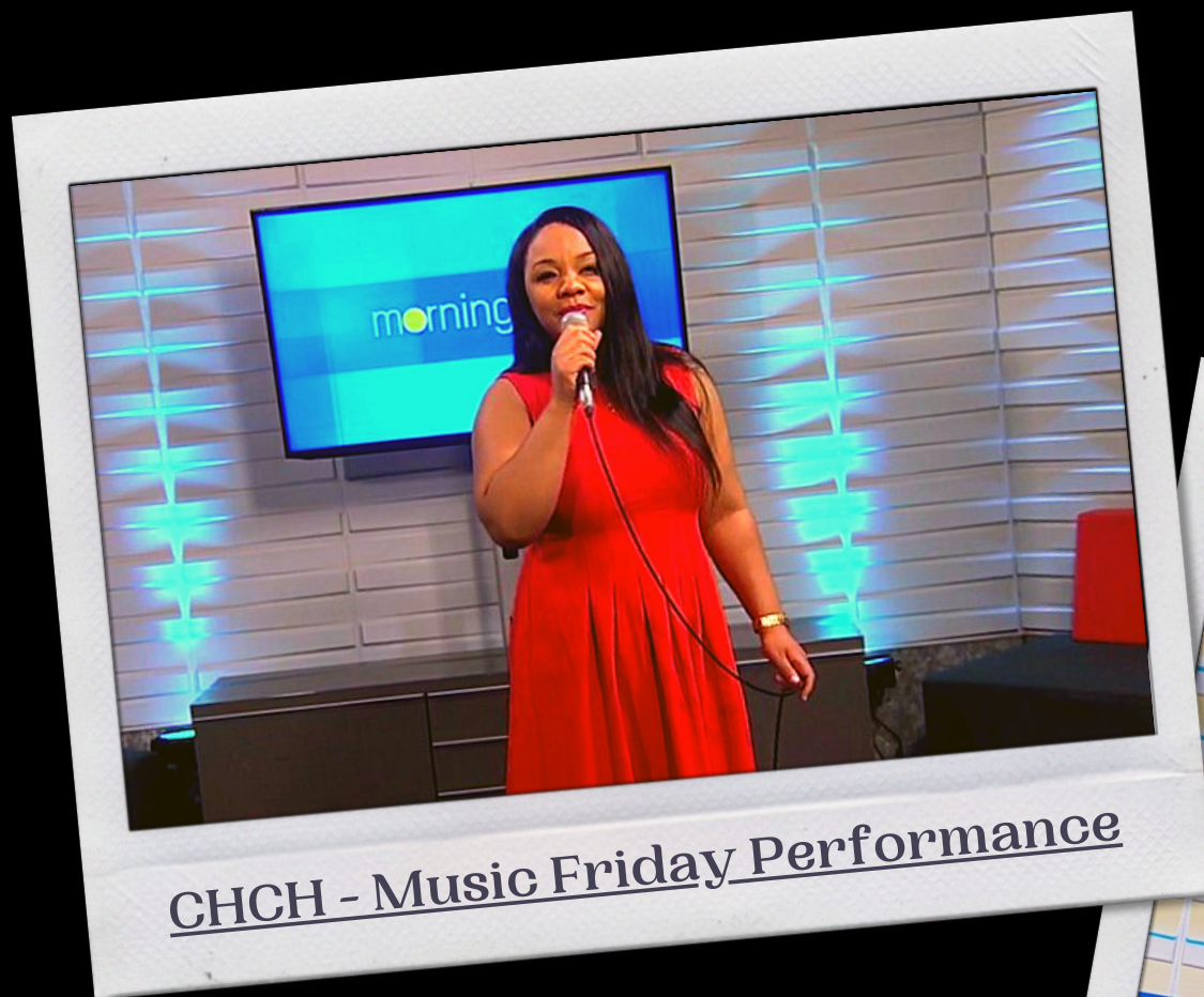
CHCH - Music Friday Performance