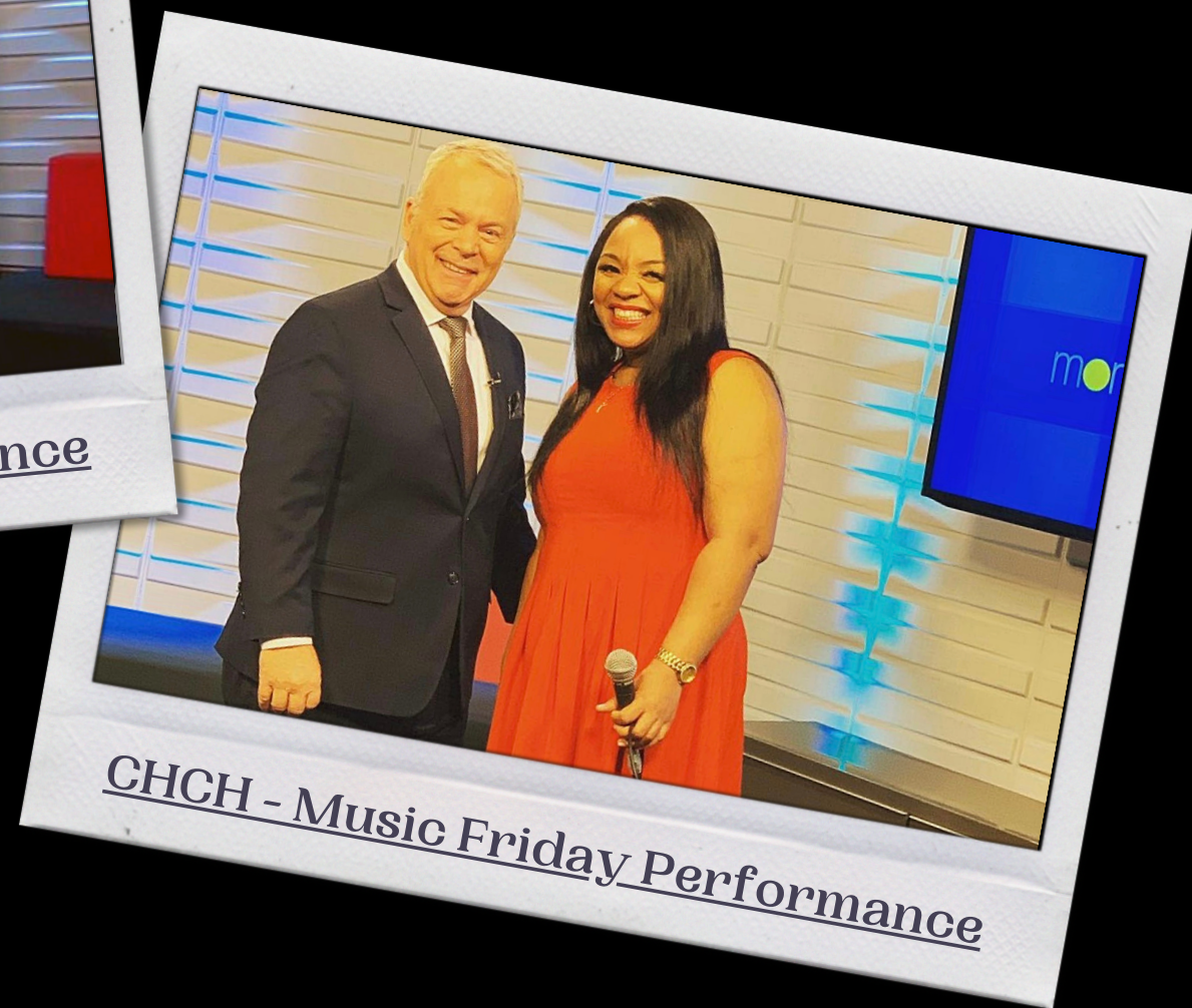
CHCH - Music Friday Performance